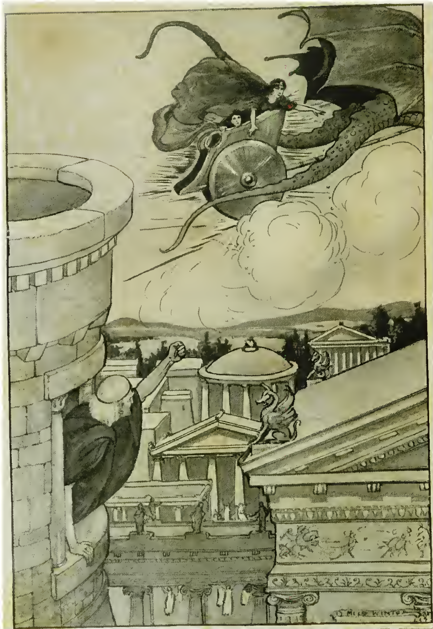
The king, hearing the hiss of the serpents, scrambled as fast as he could to the window